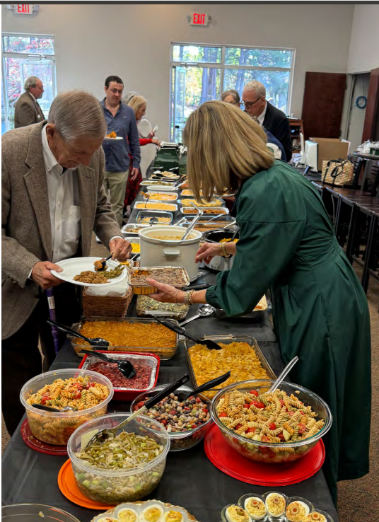
Kirkin' O' the Tartans Luncheon, November 9, 2025.