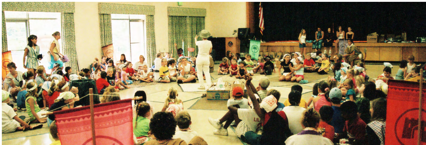
VBS 2005 in the Fellowship Hall.