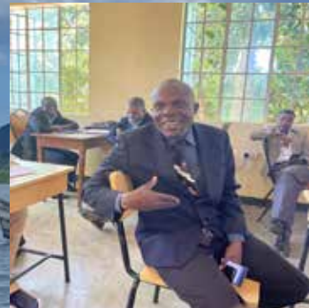
Some Seminary students in class.