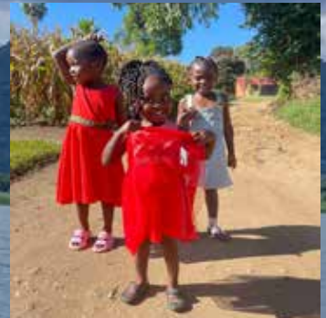
Children of Seminary students.

“What an amazing time together with our neighbors in Malawi! Purposeful in so many ways, but relationships are the tie that binds.”